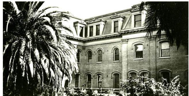
The Rose Gardens, Convent of the Sacred Heart, Menlo Park, California